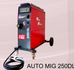
AUTO MIG 250DL