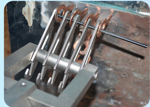
Example for placing Claw Jaw Hammer in Long Washer