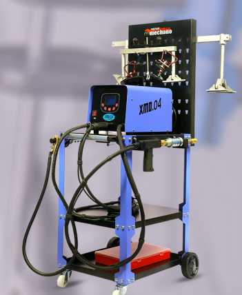
XMD 04 RHINO SERIES