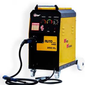
AUTO MIG 250XL