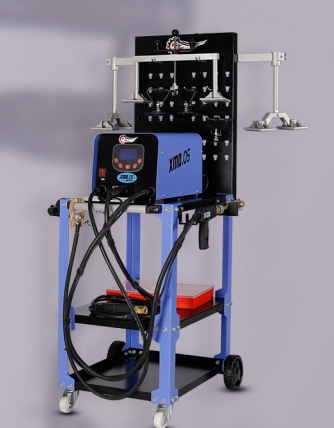
XMD 05 RHINO SERIES