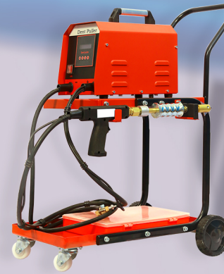
XMD 01 DIGITAL