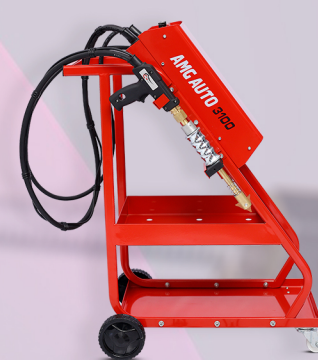
AMG AUTO 3100