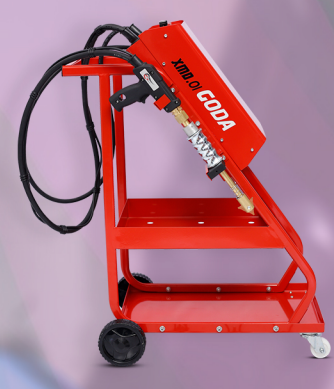
XMD 01 GODA