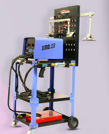
XMD 03 RHINO SERIES