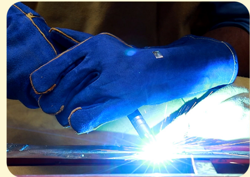
Example for welding using AUTO MIG Machines